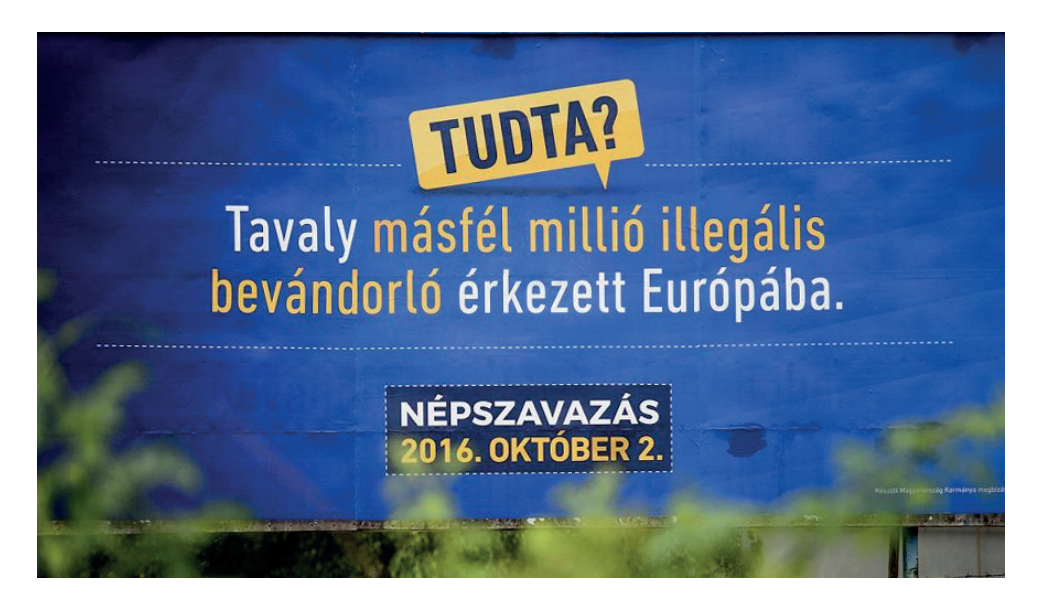
Figure 2. Did you know campaign from 2016. It reads: "Did you know? One and half million illegal immigrants arrived at Europe. Referendum 2 October 2016."